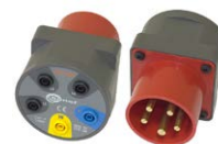
Three-phase socket adapter 16 A / 32 A