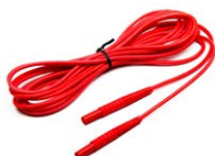
Test lead for fault loop measurement (banana plugs) 5 m / 10 m / 20 m