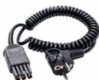
WS-04 adapter (UNI-SCHUKO angular plug)