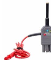
WS-07 adapter for measuring Z(L-N) loop