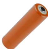
4x LR6 1.5 V battery